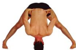
Prasārita Padottānāsana B