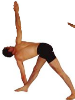
Utthita Trikoṇāsana B