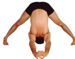
Prasārita Padottānāsana C