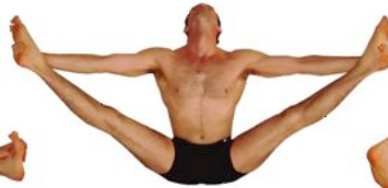
Upaviṣṭha Koṇāsana B