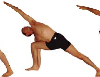
Utthita Pārvakoṇāsana A