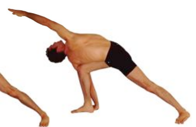
Utthita Pārvakoṇāsana B