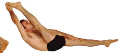
Supta Pādānguṣṭhāsana A