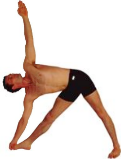
Utthita Trikoṇāsana A