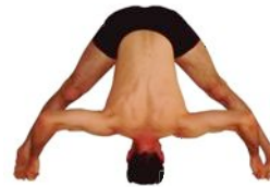
Prasārita Padottānāsana D