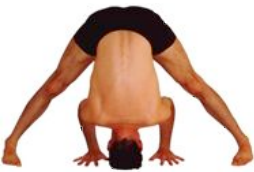
Prasārita Padottānāsana A